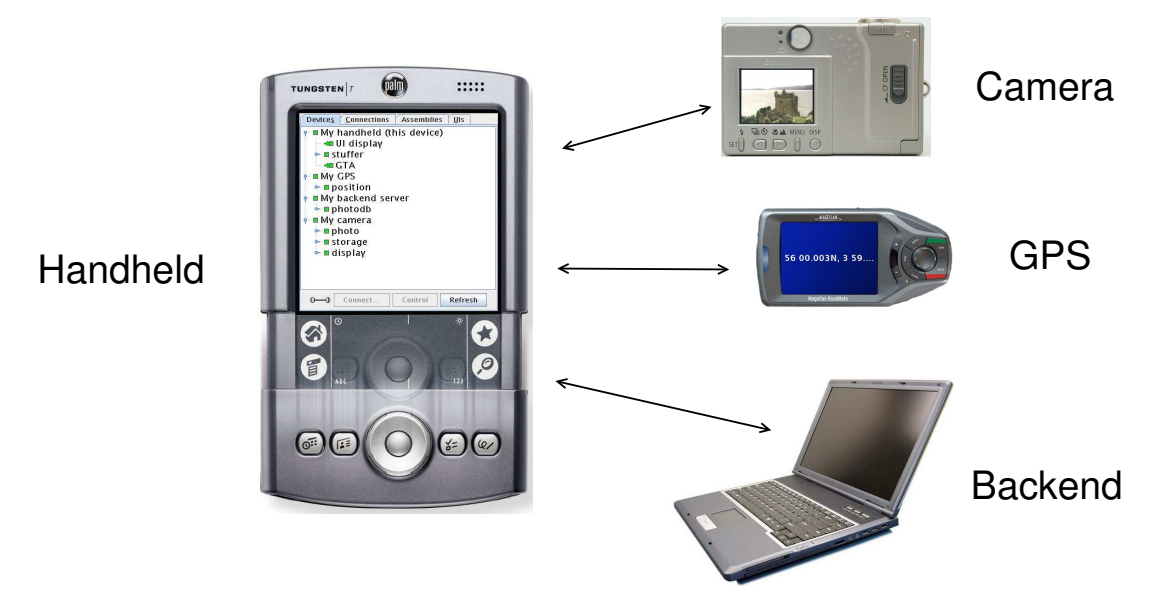
Fig. 3. The GeoTagger scenario

and dynamically. In the static part, the name and type analysis is extended to the local variables. In the dynamic part, it is checked that the bound services actually have the incoming and outgoing messages used in the script, with the appropriate message structure.